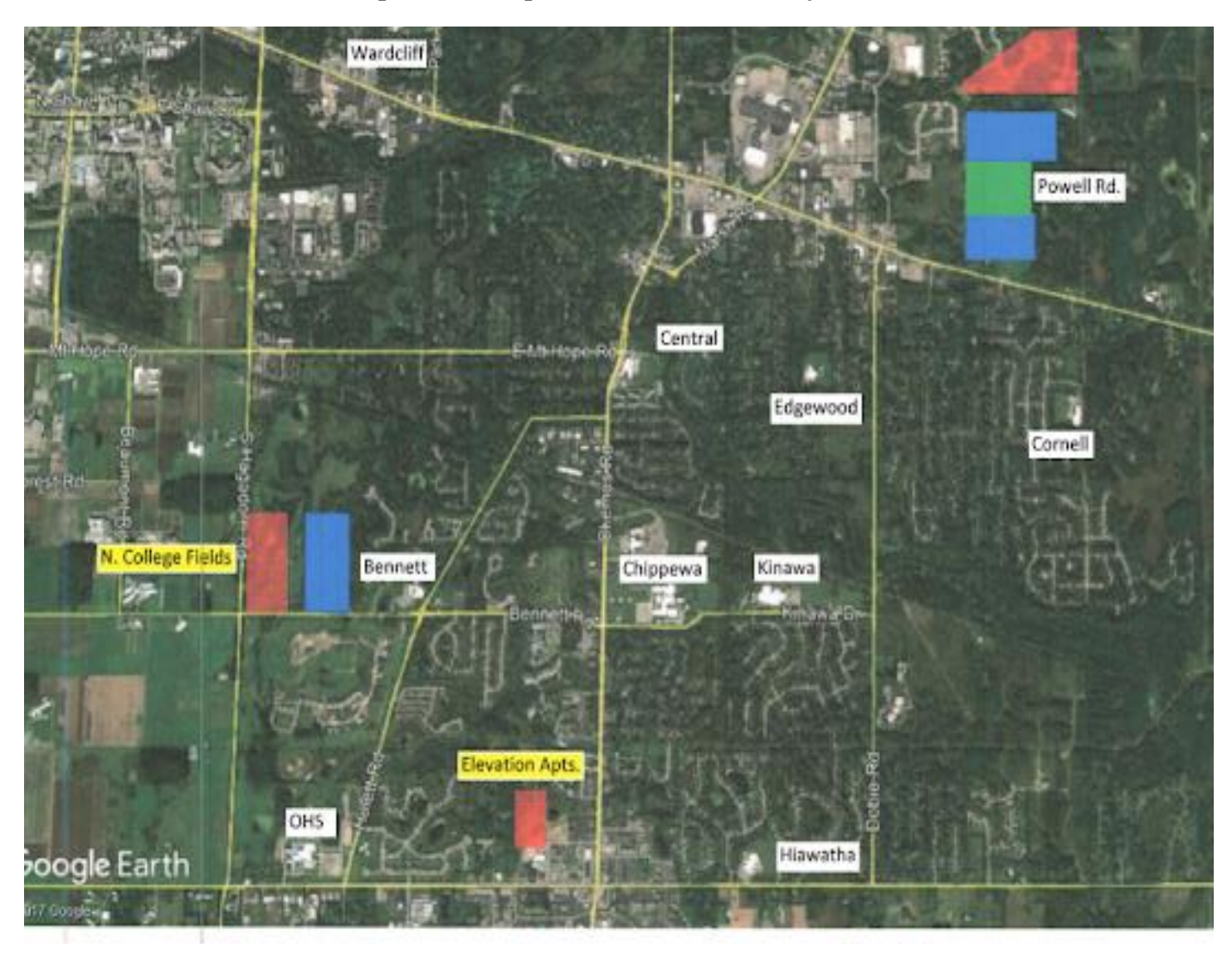
Appendix B Anticipated Development/ Construction Projects